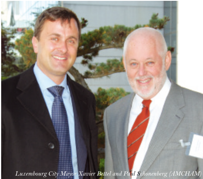
Luxembourg City Mayor Xavier Bettel and Paul Schonenberg (AMCHAM)

It's not just the people living in Luxembourg the mayor wants to see better integrated, but also the commuters who cross the borders of the country every day. Through initiatives such as Summer in the City or this year's outdoor cinema season, the mayor hopes to convince commuters to spend a few more hours in Luxembourg after work, rather than rushing home.