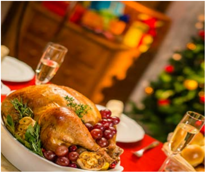
Find out more about upcoming events 2020 in Luxembourg